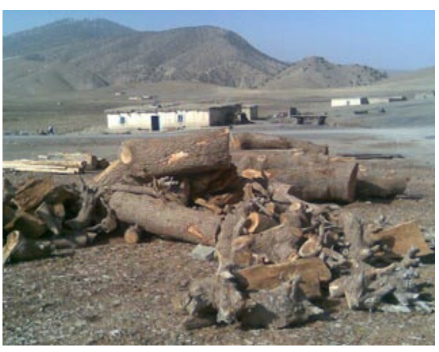
Illegal cedar logging in Morocco

"I interviewed many members of a pygmy ethnic group that had suffered as a result of these plantations and I thought it was important to re-