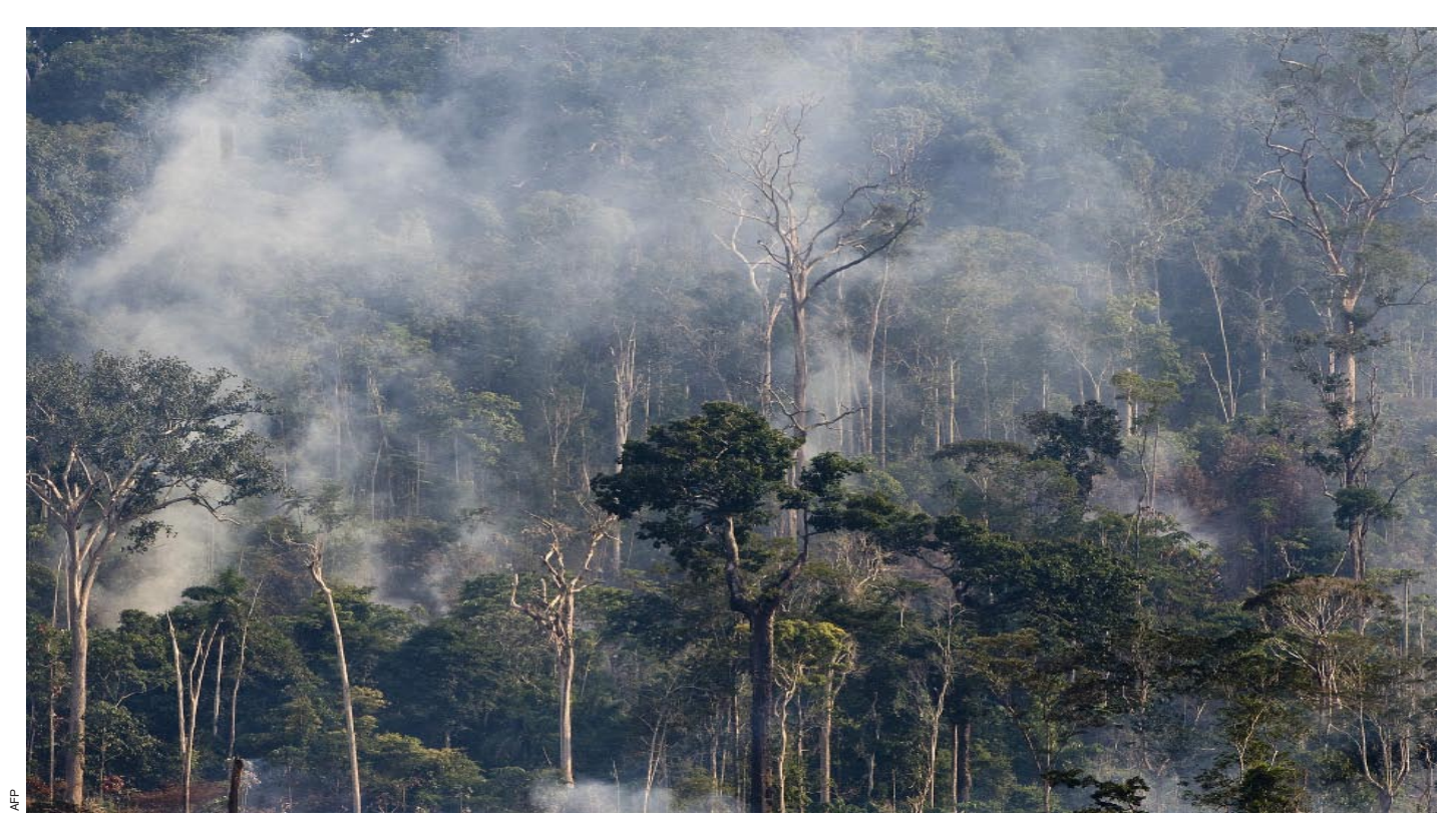
Forest fire in Brazil

Journalists have no difficulty covering global warming. Last year's international conference in Copenhagen was accompanied by unprecedented coverage of environmental problems, even in those countries that are the most hostile to media freedom. But investigating the causes of global warming, which include deforestation and industrial pollution, continues to be much more dangerous. The main obstacle to quality independent coverage of these two issues is to be found in the complicity between the private sector (such as companies and involved in logging and mining) and local authorities. Together they use "a carrot and a stick," as one Indonesian journalist put it. In other words, they threaten and buy journalists who try to cover their deplorable practices.