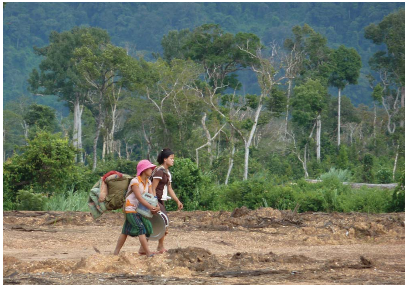
BELOW: Rural communities in Laos rely on forests for their livelihoods.

Under such an ineffective system, the Lao Government's stated aim of returning forest cover to 70 per cent of the country's territory by 2020 appears an impossible ambition. To achieve its goal the Government intends to naturally regenerate up to six million hectares of forest and to plant a 500,000 hectares of trees. Yet with an annual deforestation rate of 0.6 per cent a year, it is more likely that forest cover will decline further to just 30 per cent by 2020.8