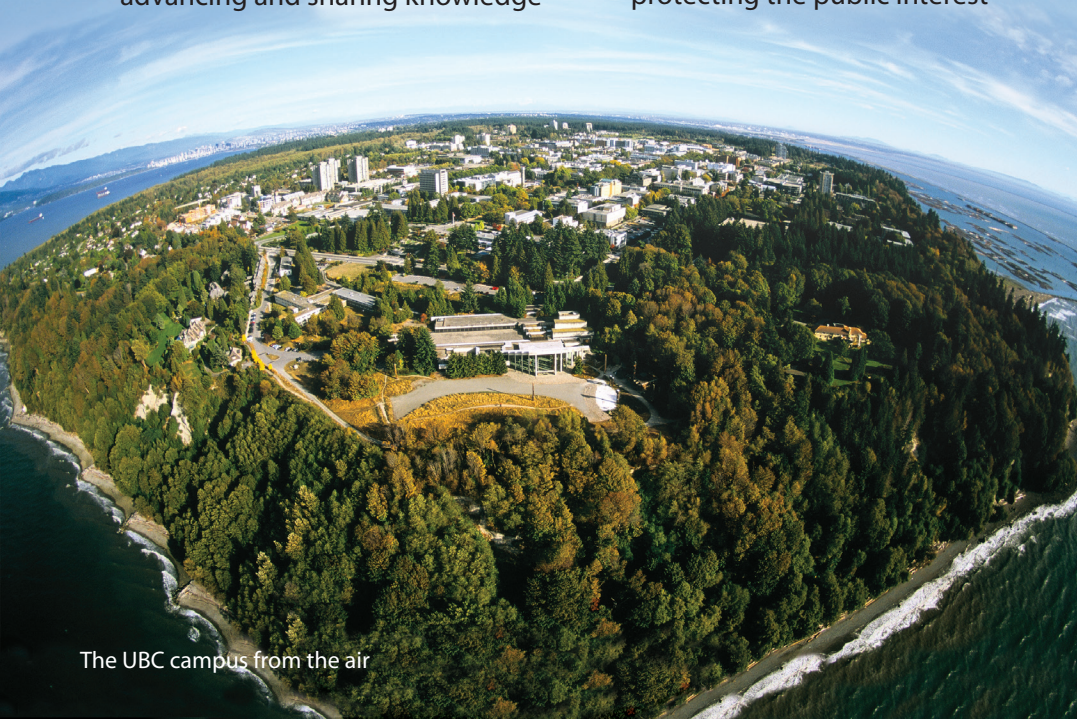
The UBC campus from the air

tel: +1.604.822.6784 email: mfm.program@ubc.ca