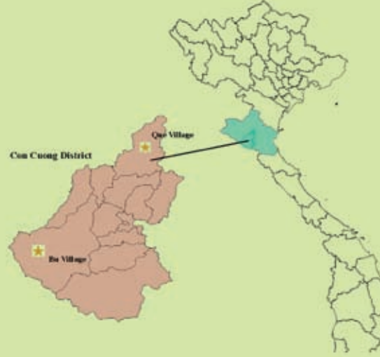
Figure 1: Location of the Study

This brief argues that if the villagers' forest management rights had been strengthened, food security issues could have been solved in these villages. We assert that although FLA has resulted in some positive effects for local people in some villages, food shortages are becoming more frequent at household levels, leading to food insecurity for many villagers. Our assertion is based on findings from two case studies in two poor villages (Bu village in Chau Khe commune and Que village in Binh Chuan commune of Con Cuong District, Nghe An Province) where local livelihoods were mainly based on income from swidden (slash-and-burn) agriculture in forests. Data collection took place in 2005 and 2010.