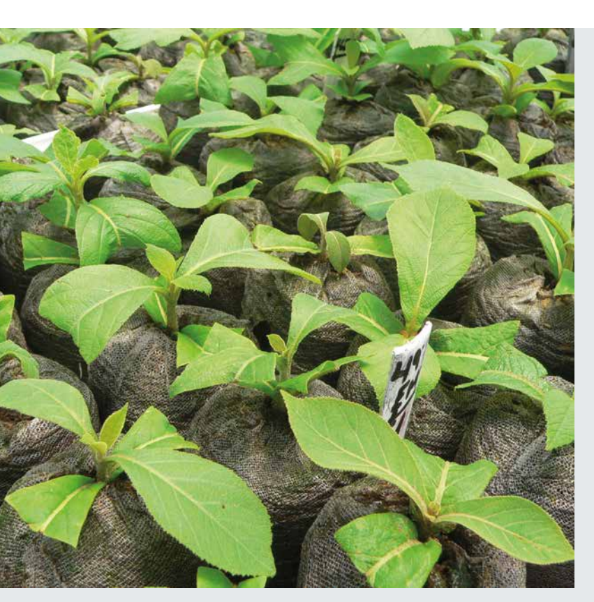
Afforestation activities should prioritize the use of native species and be located strategically to enhance ecosystem connectivity.

The present stage of validation and assessment of the REDD+ SES indicators is intended to assess the indicators in terms of applicability and feasibility as well as to identify required sources of information and to make appropriate technical arrangements for the verification of indicators. Operationalizing this will require significant resources and capacities, which according to some interviewees are not yet readily available and still needs to be developed. According to several interviewees, lack of human resources for monitoring is also still a problem. In addition, the current number of 91 indicators, most of them relating to social safeguards, seems very high, even if 50% of them could be collected through spatial analysis. In addition, many indicators have not yet specified in terms of time and quantity. While this may not be necessary for some indicators, it would be desirable e.g. in the case of biodiversity benefits to measure progress. With regard to the biodiversity safeguards indicators, our recommendation would therefore be to further specify the indicator sets in terms of time and quantities with a view towards making data collection effective but as easy as possible.