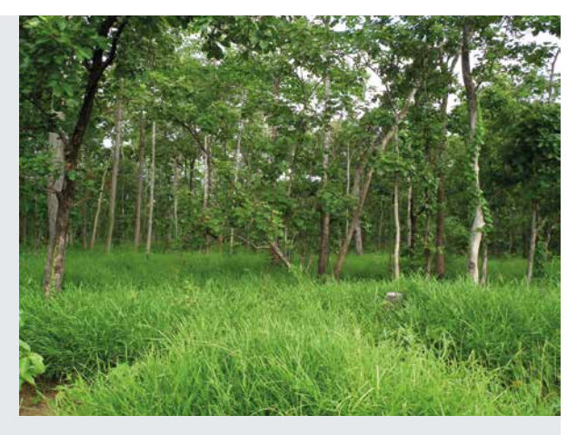
Although Lao Savannah-type forests store less biomass than humid forests, they are still important for biodiversity conservation.

Although Lao PDR retains one of the highest proportions of forest cover in Southeast Asia, its forests have declined dramatically from originally 70% of the total land area to about 40% in 2010 (DoF 2011a), with an increasing rate of deforestation and especially degradation. It is a highly biodiverse country (e.g. part of WWF's Global Freshwater Ecoregions and a Tiger Range country) in which large proportions of the population depend often directly on ecosystems and the services they provide. An official strategy of the government of Lao PDR is to increase both forest cover and quality, and to use them in order to se-