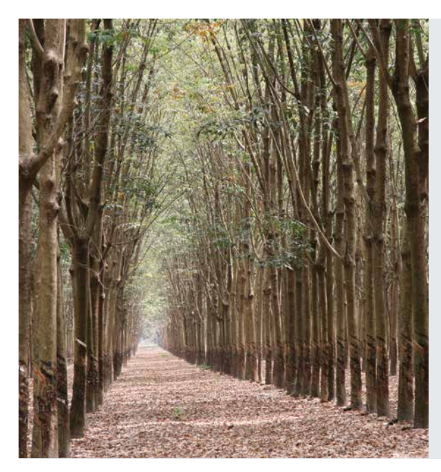
The establishment of rubber plantations has been a significant driver of natural forest loss in South East Asia.

As some of the current REDD+ projects in NPA show, not all NPAs will be able to benefit financially from REDD+, specifically under a historical baseline/REL approach. Determining whether or not a 'conservation levy' on REDD+ activities is a realistic option in terms of political will and administrative procedures is beyond the scope of this study. Still, as in Ecuador, there is precedence for such a levy in Lao PDR: The Forestry and Forest Resource Development Fund (FRDF). The FRDF is sourced from the sales of timber and