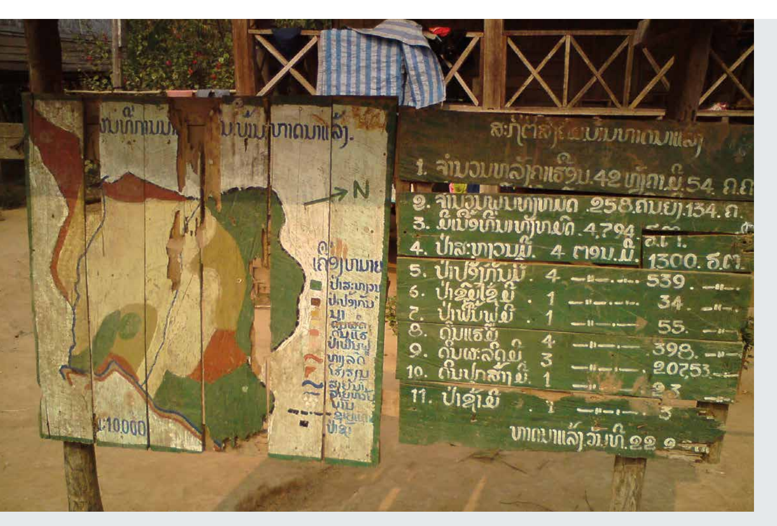
Plan for land use zoning on the village level in Sayabouli province, Lao PDR.

Secondly, the team interviewed 40 key resource persons (involved either in REDD+ and / or biodiversity conservation) from a total of approximately 50 different organisations. This included interviewees from ministries, government agencies/departments, NGOs, IGOs, development cooperation agencies, the private sector and individual experts.