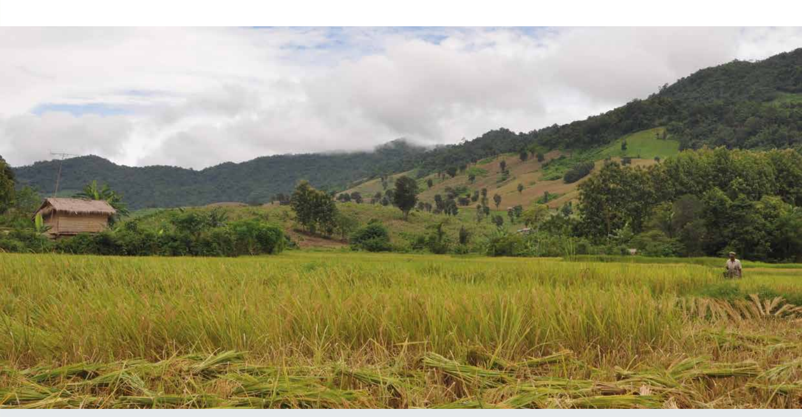
Rice cultivation close to Nam Phui National Protected Area, Thongmixai district, Lao PDR.

One of the reasons for this is that the integration of further, more concrete formulations on the contribution of REDD+ to biodiversity conservation and the reduction of REDD+ related risks is generally challenging. This is par-