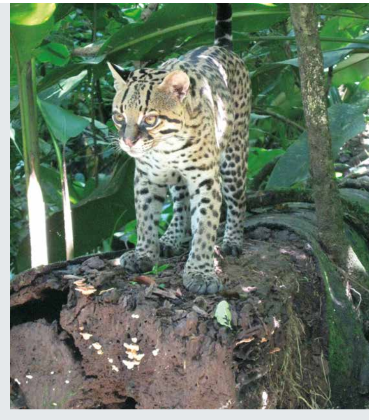
Ocelots used to be hunted extensively for their fur, but protection efforts have led to a recovery of numbers in recent years.