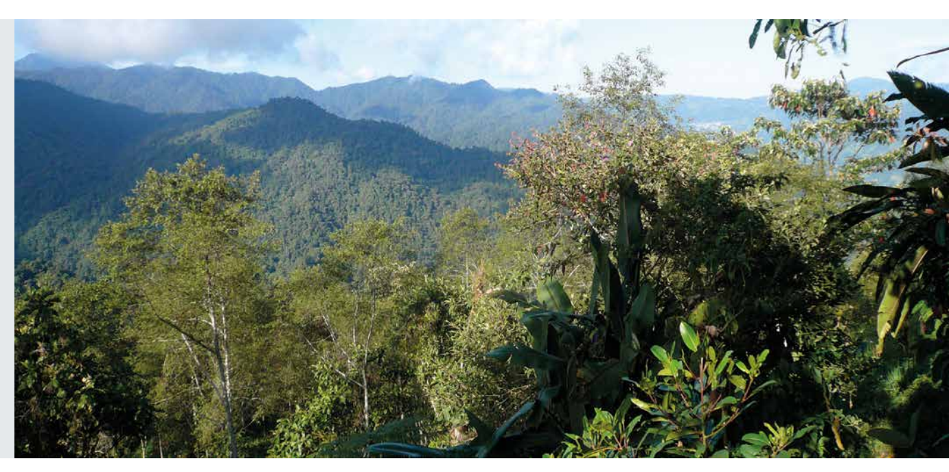
Forests, such as the Saint Lucia cloud forest, and their biodiversity form an important part of Ecuador's natural and cultural heritage.

ees did generally expect that REDD+ would likely focus on forest ecosystems in the Amazon (due to high carbon stocks and high deforestation rates; confirmed by the current spread of REDD+ initiatives), it was deemed unlikely that agriculture would shift geographically into dry forests in the coastal areas, as the region is already highly populated and available land is scarce. Furthermore, interviewees did not perceive the risk of REDD+ fuelling the conversion of biodiversity-rich non-forest ecosystems into tree plantations, since Ecuador has already explicitly excluded tree plantations from the forest definition.