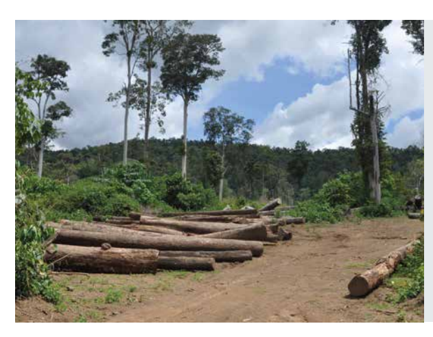
Logging deck in a production forest in Sayabouli province, Lao PDR.

In this context it is also important to note that Lao PDR is currently in the process of strengthening its forest governance and law enforcement through the FLEGT process. This will include specific requirements regulating forest tenure and management as well as the development of a control system for timber production and trade, which will also be relevant for and support the implementation of REDD+ in the country.