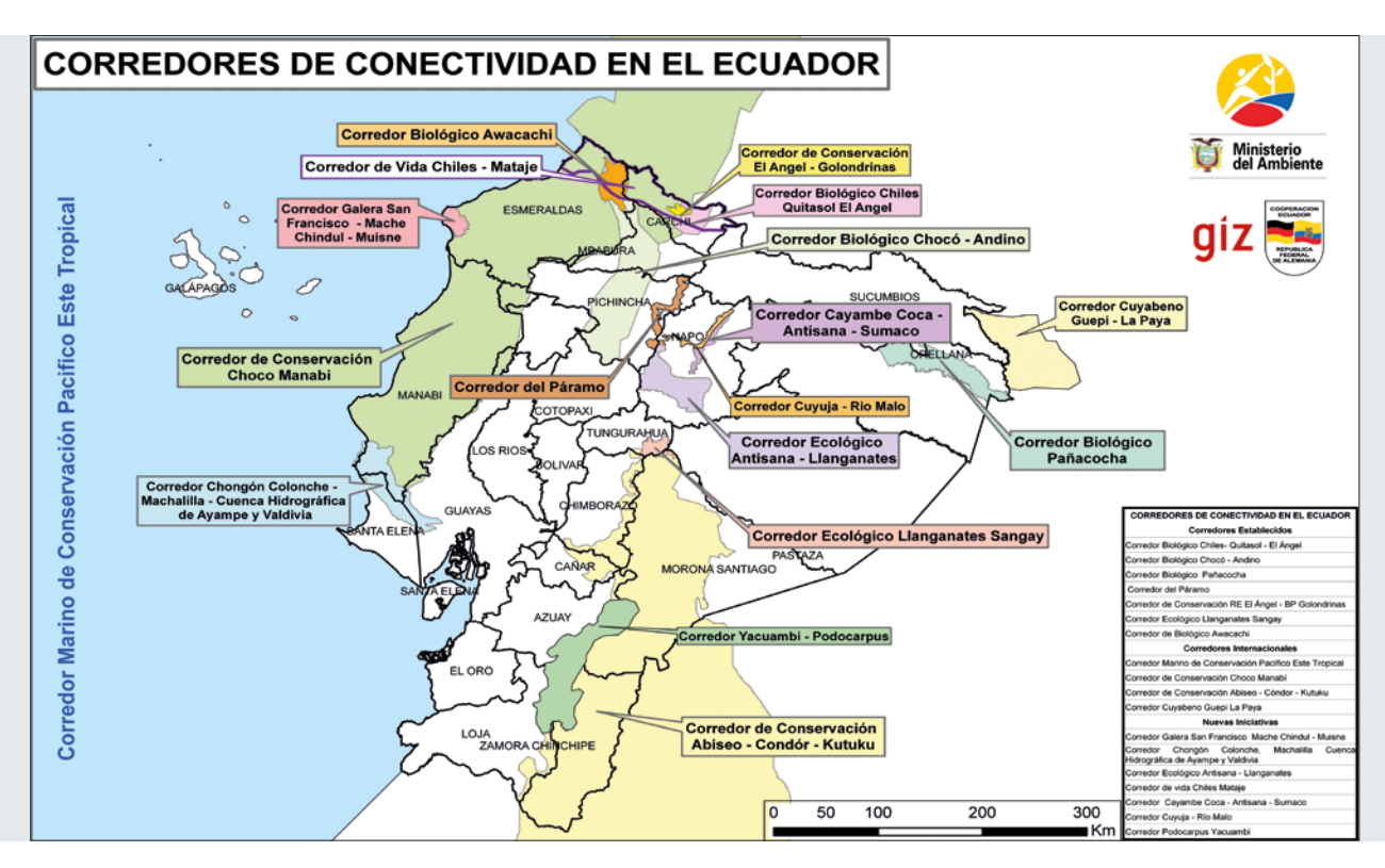
Illustration 1: Map of established and potential corridor initiatives in Ecuador.

With regard to concrete opportunities and benefits from REDD+ for biodiversity conservation, the most important issues mentioned in the interviews were: