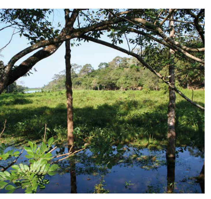
Strategic environmental assessments can help to identify potential impacts of REDD+ projects on natural habitats.

designation of high conservation value forests (HCVF); and b), to finance the establishment of biodiversity corridors between NPA, which would increase connectivity.